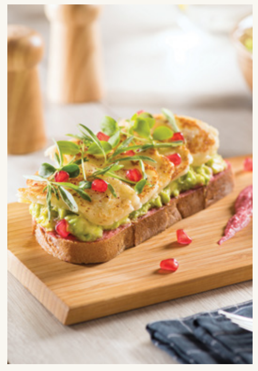
HALLOUMI & AVOCADO BRUSCHETTA