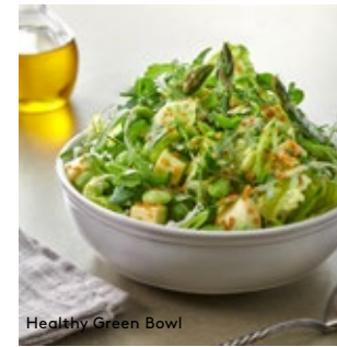
Healthy Green Bowl