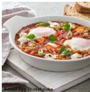
Baked Egg Shakshouka