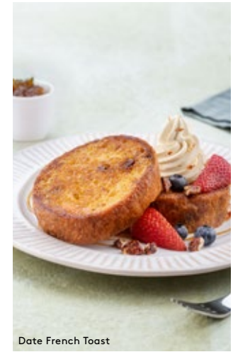
Date French Toast