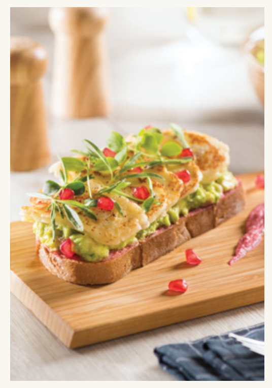
HALLOUMI & AVOCADO BRUSCHETTA